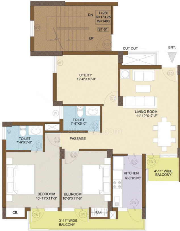
3 Bed Room Area 1266 Sq. Ft.