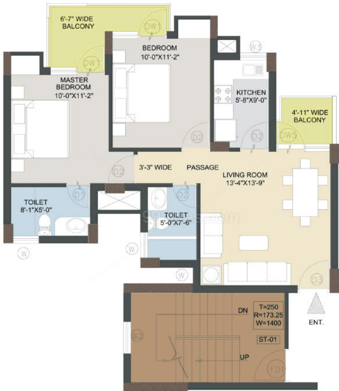
2 Bed Room Area 930 Sq. Ft.